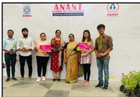
On 21st Oct 22 Free Homoeopathic Medical Camp conducted at Laxman Gyanpith School and Anant School of Excellence, Sanskardham on the occasion of World Osteoporosis Day and for Paediatrics organised by Sainath Hospital attached with Ahmedabad Homoeopathic Medical College