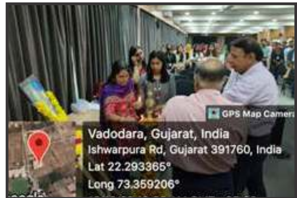
Department of Community Medicine PIHR organised a workshop on 22nd October 2022