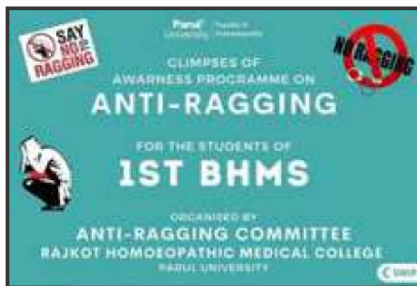
On 12th Oct 22 Awareness on Anti-Ragging Programme was organized at RHMC