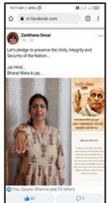
A pledge taking ceremony was organised to celebrate Rashtriya Ekta Diwas on 31 st October 2022