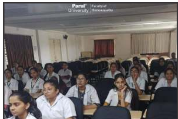
On 19th Oct 22 ALUMNI TALK ON INTEGRATION OF HOMOEOPATHY WITH NUTRITION FOR ACCELERATING YOUR PRACTICE AT AHMC