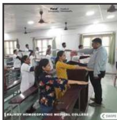
Pledge Taking Ceremony on the occasion of National Unity Day was organised at RHMC