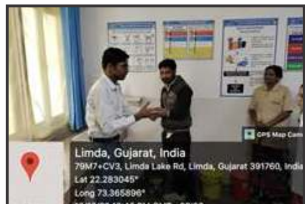
Global Hand Washing Day was celebrated in JNHMCH on 15th October 2022