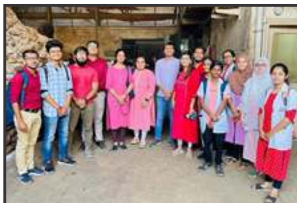
On World Arthritis Day 12th October 2022 Camp was organised at AHMC