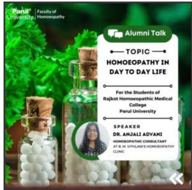
Alumni talk on Homoeopathy in day to day life at RHMC