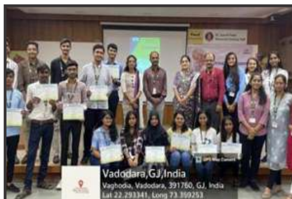
Symposium was organised by Department of Physiology PIHR on 14th October 2022