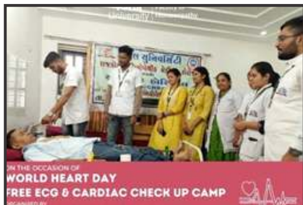
To celebrate World Heart Day Free ECG & Cardiac Checkup Camp at RHMC on 1st October 2022