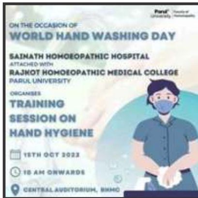
On 15th Oct 22 on World Hand Washing Day A Training Session on Hand Hygiene was organised at RHMC