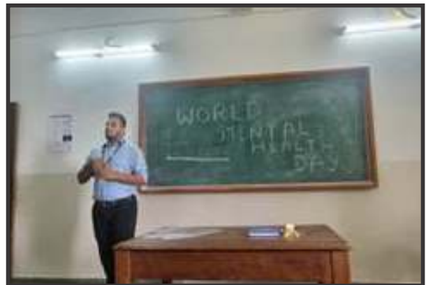
World Mental Health Day was celebrated in JNHMCH on 10th October 2022